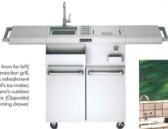
(Clockwise from far left) Fire Stone's convection grill, KitchenAid's refreshment center, Marvel's ice maker, and Sub-Zero's outdoor refrigerator. (Opposite) Dacor's warming drawer.