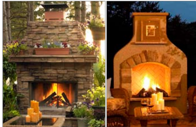
San Juan Insert with stacked stone finish.